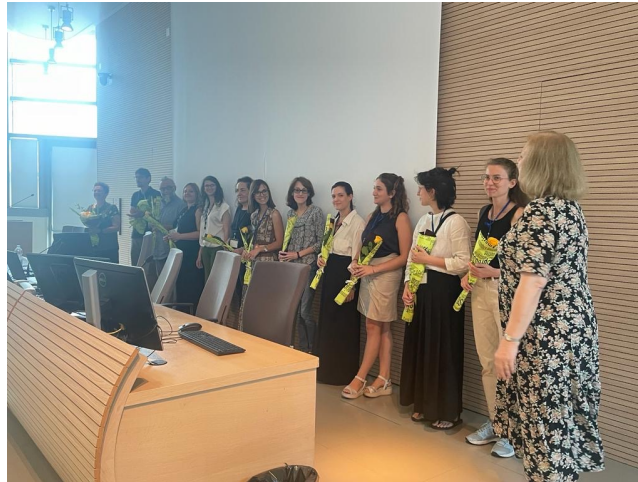
our priceless volunteers