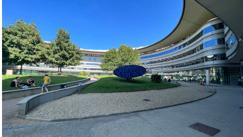
the venue: Campus Luigi Einaudi