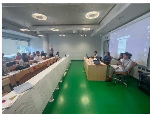
the meeting on academic freedom