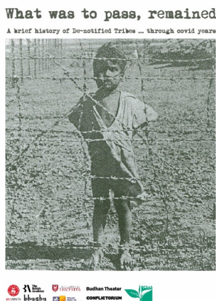
1. Exhibition poster

During the Conference the exhibition 'What was to pass, remained' was held in the Main Hall of Campus Luigi Einaudi. It is a brief history of the De-notified tribes reaching to the Covid years, organized in collaboration with the Arts and Humanities Research Council UK, the British Academy and the School of Museum Studies University of Leicester, Budhan Theatre, Conflictorium-Museum of Conflict Ahmedabad, and Bhasha Research and Publication Center.