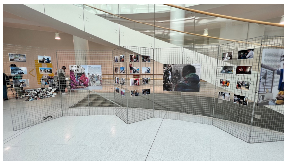
the exhibition in the main hall