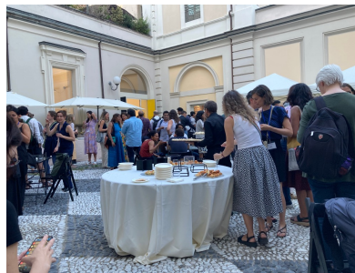
last but not least, moments of leisure