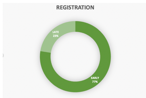
5. Registration time