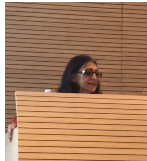
moments from the keynotes